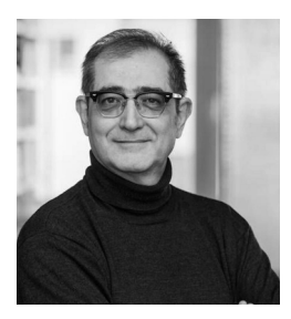
Producer's Note Samir

The essence of THE BLIND FERRYMAN lies in the "inside view" of the blind protagonist, blurring reality, and imagination. Through a subjective lens, we delve into characters' depths against the backdrop of beautiful marshlands. Inspired by my blind aunts' unique perspective, the film reveals truths hidden from the sighted. It explores the thin line between reality and fantasy, offering hope and showcasing the human spirit's resilience. THE BLIND FERRYMAN aims to inspire viewers to perceive the world differently and believe in the power of their imagination.